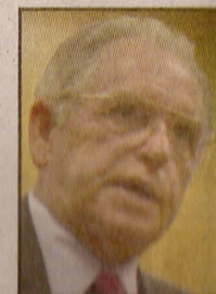
Sen. Charles Bishop